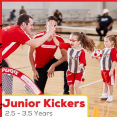
Junior Kickers 2.5 - 3.5 Years