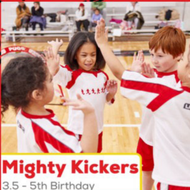
Mighty Kickers 3.5 - 5th Birthday