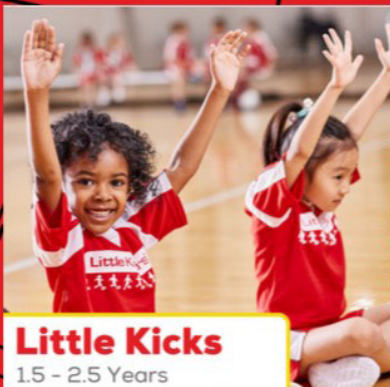
Little Kicks 1.5 - 2.5 Years

Soccer training and development for children aged 18 months to 8th birthday.