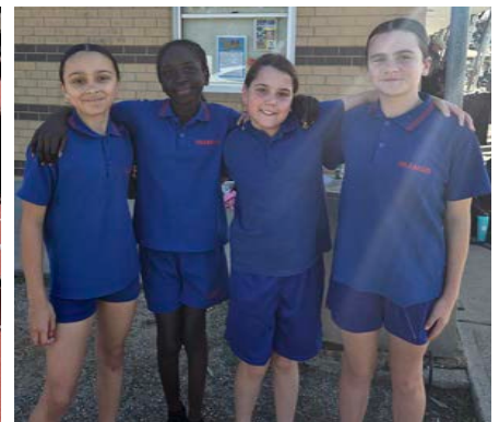
IRAMOO RELAY TEAM