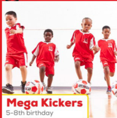
Mega Kickers 5-8th birthday